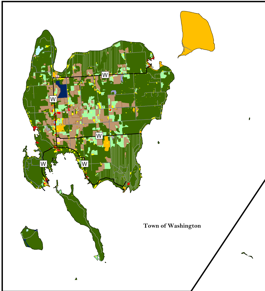
Town of Washington